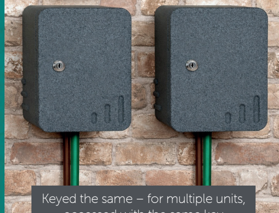
Keyed the same – for multiple units, accessed with the same key

Available in 4 colours to suit any exterior